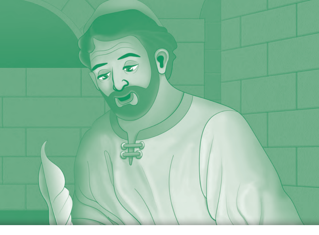
UNIT I: Challenges to the Faith